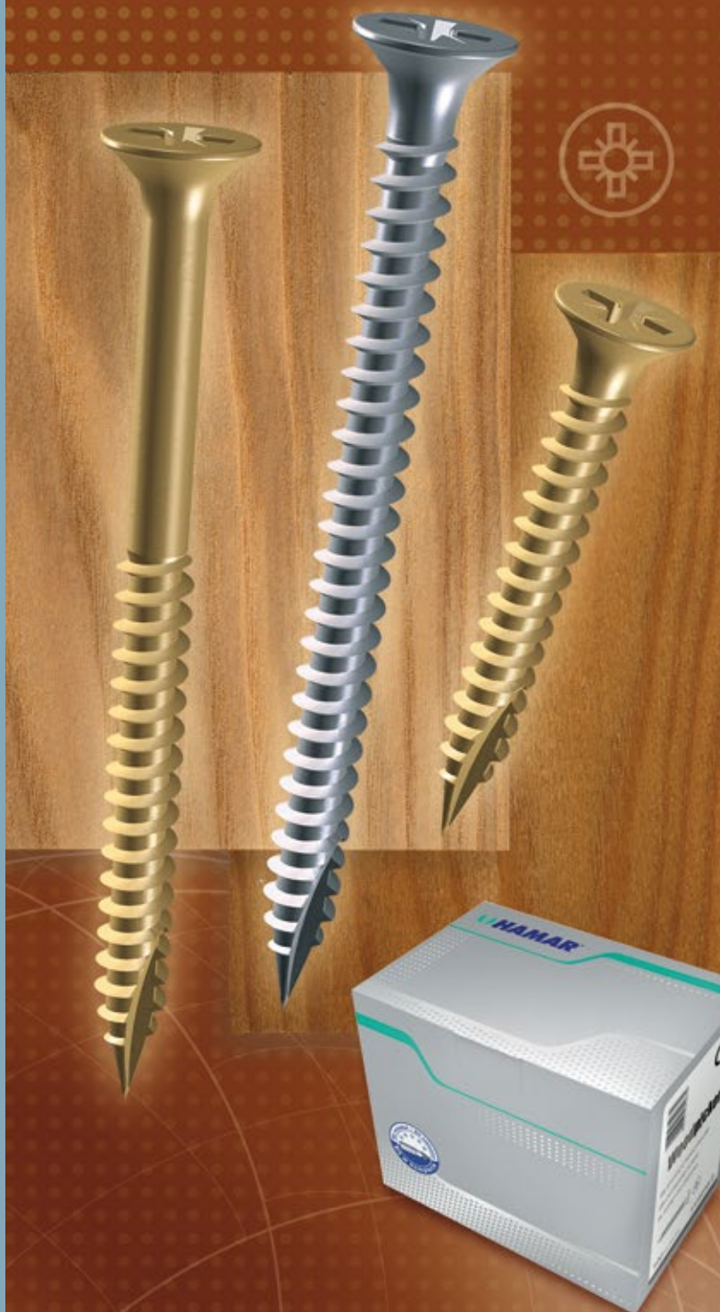
Common chipboard screw Zwykły wkret do drewna